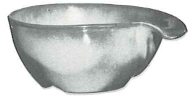
*4X—14 OZ. CEREAL—1.50