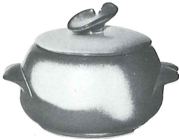
*4V—2 QT. BAKER/BEAN POT—5.00