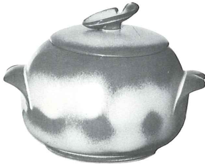
*4W—3 QT. BAKER/BEAN POT—6.50