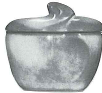
4B—SUGAR WITH LID—2.50