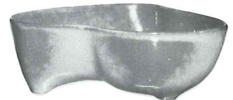
*4N—24 OZ. VEGETABLE—2.00