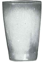
*5L—12 OZ. TUMBLER—2.00