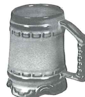
*M1—15 OZ. STEIN—2.50