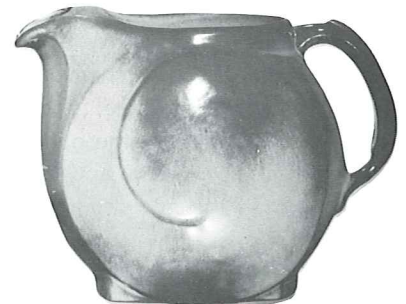
*4D—2 QT. PITCHER—5.00

THIS PAGE AVAILABLE IN PRAIRIE GREEN, DESERT GOLD AND BROWN SATIN, EXCEPT WHERE NOTED*