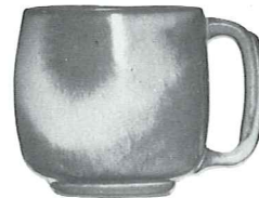
*4M—18 OZ. MUG—2.50