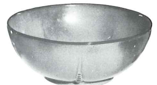
*224—8" ROUND BOWL—3.00