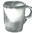
*5CC—5 OZ. TEACUP—1.50