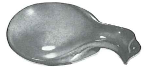
*4Y—6" SPOON HOLDER—1.50