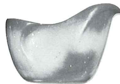
4A—8 OZ. CREAMER—2.00