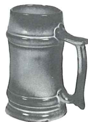
*M2—18 OZ. STEIN—2.50